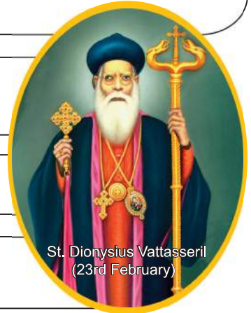
St. Dionysius Vattasseril (23rd February)

Pethrutha of Great Lent - Shubkkono Service